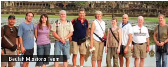
Beulah Missions Team